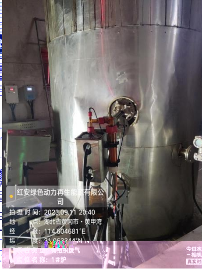
( ) - 1#